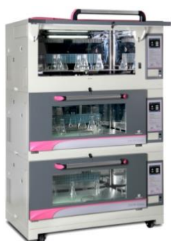
ZWYR-D2403 with P5017