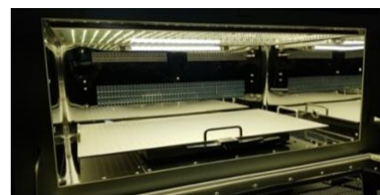
P5011WW: (100% Warm White)

*Fully customized color combinations are available, contact Labwit representatives for more information.