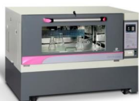
ZWYR-D2401 With P5010-35