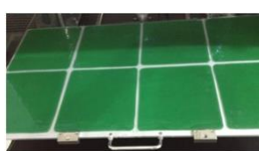
P8017 Sticky Mat