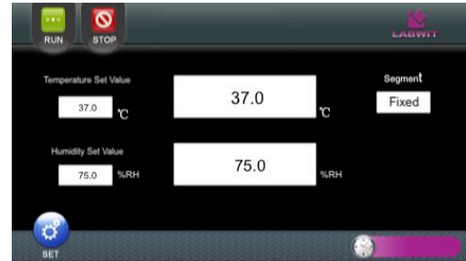
Touch Screen Controller