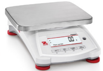
PX12001 and PX12001/E model