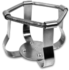
HSC-500 BS-010167-JK clamp

Tight fit clamp 250 ml - Ø85 mm for UP-168