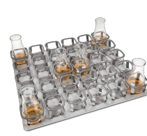
HSP-30/100 BS-010167-KK platform

Platform with tight fit clamps for flasks.