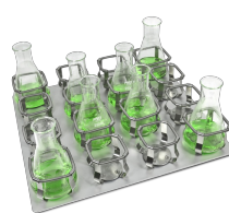
HSP-16/250 BS-010167-MK platform

Platform with tight fit clamps for flasks.