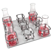
HSP-9/500 BS-010167-NK platform

Platform with tight fit clamps for flasks.