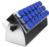
TR-21/50 BS-010135-KK rack

Adjustable angle test tube rack for UP-168