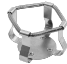
HSC-250 BS-010167-FK clamp

Tight fit clamp 100 ml - Ø65 mm for UP-168