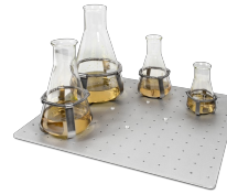
UP-168 BS-010135-JK platform Universal platform with clamps can accommodate flasks or bottles of different volume sizes. Clamps are not included with platform and need to be ordered separately.