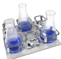
HSP-6/1000 BS-010167-LK platform

Flat platform with non-slip silicone mat can accommodate various low profile containers.