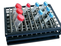
P-16/88 BS-010116-BK platform

Platform with spring holders for up to 88 tubes up to 30 mm diameter (e. g. 10 ml, 15 ml, 50 ml tubes).