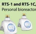
RTS-1 and RTS-1C, Personal bioreactor