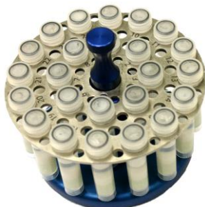
2. Rotor Figure 1.