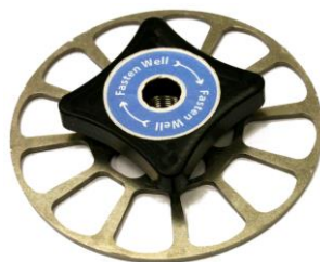
3. Rotor lid