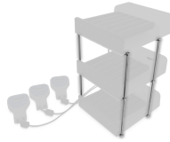
Stacking kit for 3 x CTR-6 BS-010174-CK