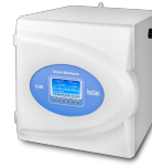
S-Bt Smart Biotherm Software included + RS6, rack with 3 shelves Compact CO 2 Incubator