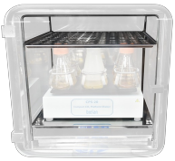
RS2 BS-010425-HK rack for CPS-20 / CTR-6 installation