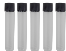
Glass test tubes 18mm BS-050102-NK

McFarland Turbidity Standards, \varnothing 12 mm