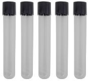
Glass test tubes 16mm BS-050102-MK

Glass Test Tubes 16x100mm, high borosilicate, PP Cap with silicone pad. Packing - 100 pcs/box