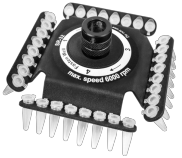
SR-32 BS-010205-FK rotor

Rotor for 2 x 8-section 0,2 ml microtube strips