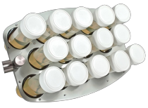
PRS-14 BS-010118-BK platform

14 tubes 20-30 mm diameter (50 ml tubes).