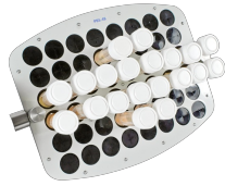
PRS-48 BS-010118-CK platform

14 tubes 20-30 mm diameter (50 ml tubes).