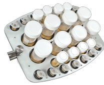
PRS-8/22 BS-010118-AK platform

48 tubes 10-16 mm diameter (1.5 ml-15 ml tubes).