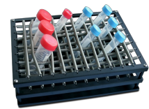
P-16/88 BS-010116-BK platform

Platform with spring holders for up to 88 tubes up to 30 mm diameter (e. g. 10 ml, 15 ml, 50 ml tubes).