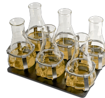
P-6/250 BS-010108-DK platform