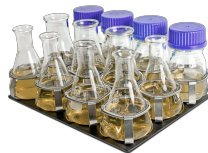
P-12/100 BS-010108-EK platform

Flat platform with non-slip silicone mat for Petri dishes, culture flasks, agglutination.