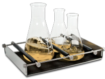
UP-12 BS-010108-AK platform

Universal platform with adjustable bars for different types of flasks, bottles, and beakers with silicone mat.