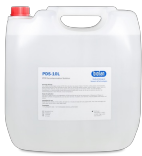
PDS-10L BS-040107-FK DNA/RNA Decontamination Solution 10l