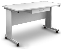
T-4L BS-040107-BK Table

New modular design of laboratory furniture provides flexibility and ease of use.