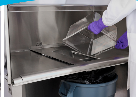
Stainless steel bang bar ensures waste gets successfully dumped into chute.