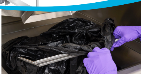
Easily attach garbage bag to waste chute. No tools necessary!