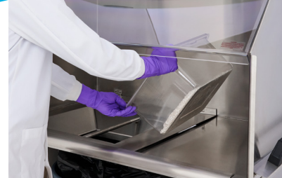
Extra large 14 in [356 mm] access opening comfortably fits rat cages.